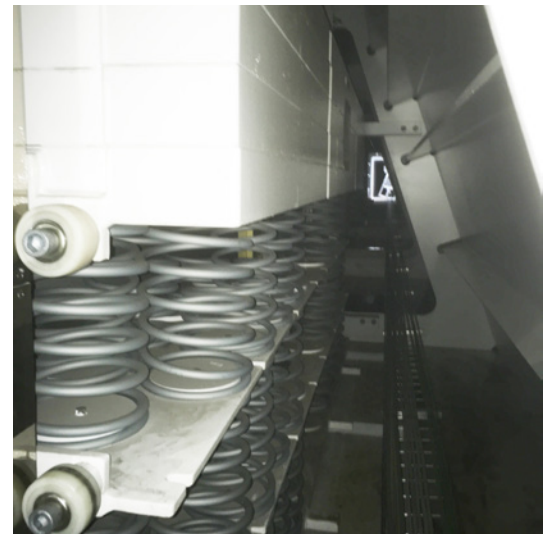
View into the “depth” – i.e. length – of the roof girders. At the top of the picture the elongated vibrating mass, at the bottom the spring packages that have been individually adjusted to the frequencies of the girders. The inclination on the right results from the geometry of the steel box girders. The light in the center shows the next entrance.