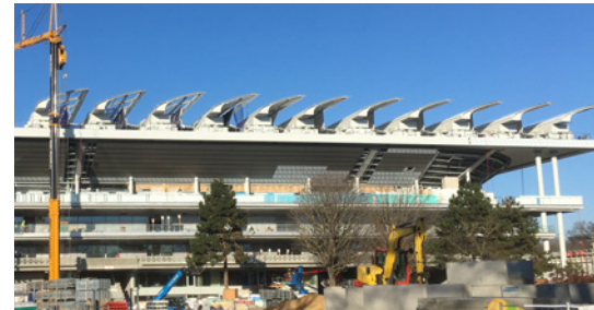
Roland Garros jobsite: easily discernible the about 3 m high “wings”, in mounting condition extended to about three quarters.

For this reason, the ten steel girders were equipped with vertical vibration dampers (TMD – Tuned Mass Damper). These TMDs have a mass block resting on steel coil springs. The vibration of the mass counteracts the structural vibrations in vertical direction, thus reducing the vibrations by factor 2 – 8. The required dimensions of the vibrating TMD mass crucially depend on the mass of the moving structure. In Paris, each steel girder needed a TMD with eight tons of vibrating mass – but where can this mass be accommodated given the slender steel girder geometry? “We have placed the eight tons into the steel girders,” explains project manager Luca Paroli from MAURER. “This was admittedly a challenge since the geometry of the long, slender girders was specified.” So, the damper geometry was elaborately adapted to the steel boxes.