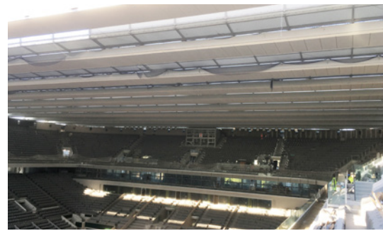
View into the "new" stadium in February 2020. The roof girders run on tracks on the left and on the right.

Moreover, two of these spherical bearings were designed as uplift bearings, which means: they do not only accommodate pressure and rotations but uplift forces as well. This is particularly important when wind hits the moving roof. The uplift bearings are positioned underneath the second girder. At the same time, these specially designed bearings enable restraint-free transfer of vertical uplift forces in any rotation and displacement condition.