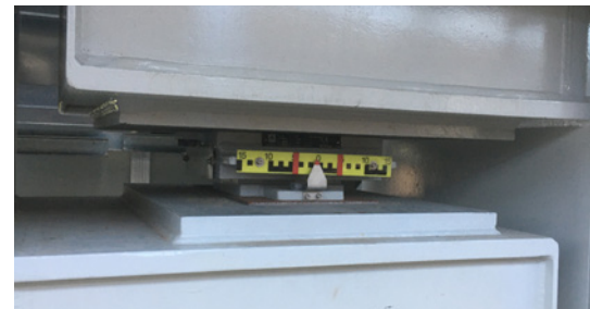
The roof girders rest laterally on spherical bearings. There was no sufficient space available for the initially planned elastomeric bearings.