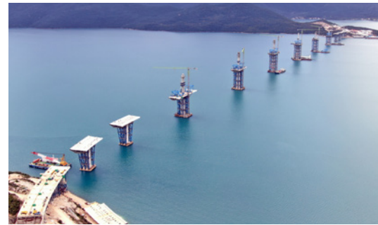
September 2020: View onto the Pelješac peninsula. The bridge is scheduled for inauguration in 2022.