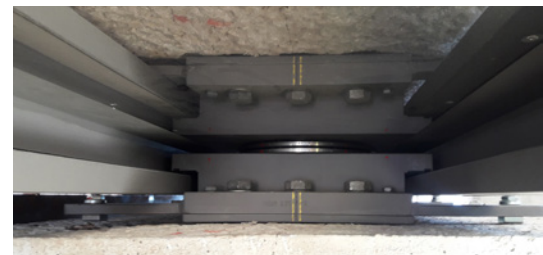
Attention, mirror image! The bearing (lower half) is reflecting in the mirror-bright sliding plate made of stainless steel (top). This is why the cramps preventing uplift forces appear double at top and bottom.