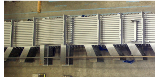
One of the two expansion joints with a length of 23.6 m, type swivel-joint expansion joint DS1400 with 14 profiles; picture taken in the production hall in Munich prior to delivery to Croatia.