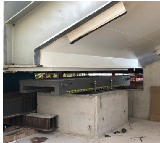
Spherical bearing with a length of 3 m on the concrete base, the white steel deck has still to be lowered. The bearings accommodate vertical forces of up to 33 MN. Clearly visible: the cramp shape of the upper sliding plate that prevents the bridge from uplifting for forces up to 2 MN.

Furthermore, all bearings have to accommodate large, fast movements of up to \pm 1.3 m in case of an earthquake. That requires a bearing length of up to 3 m. The largest bearings feature a width of 1.2 m and a height of approx. 330 mm.